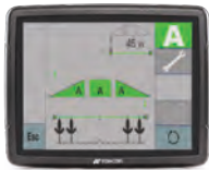
Touchscreen Console ISO-UT compatible display, including Topcon Pulse, X25, and X35