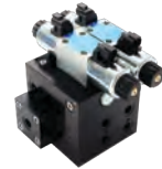
Proportional Valves Proportional Valve on each wing to ensure smooth independent hydraulic control