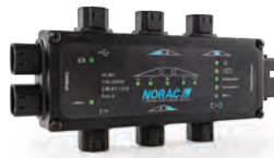
Implement Controller Norac HCM1 controller for proven reliability and clear calibration